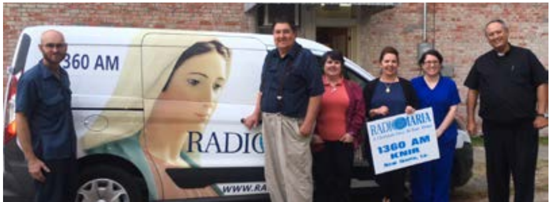
Volunteers from Radio Maria in New Iberia, 1360 AM, KNIR