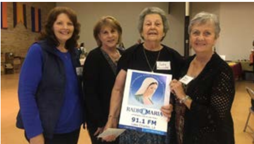
Radio Maria supporters attending Catholic Charismatic Conference in Lake Charles, LA