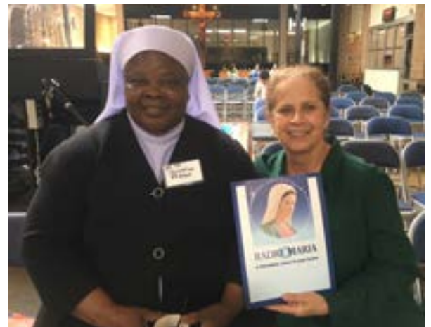
RM supporters attending Catholic Charismatic Conference in Lake Charles, LA