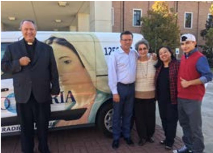
Diocese of Beaumont volunteers