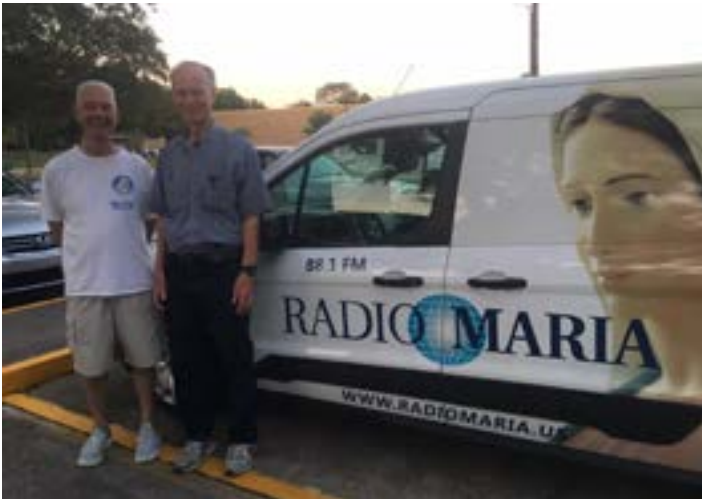
Diocese of Biloxi volunteers