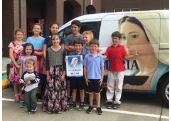
Diocese of Biloxi home school group meeting in Hattiesburg, Ms Praying for Radio Maria.