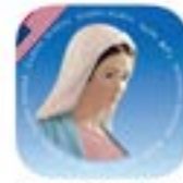
Radio Maria USA