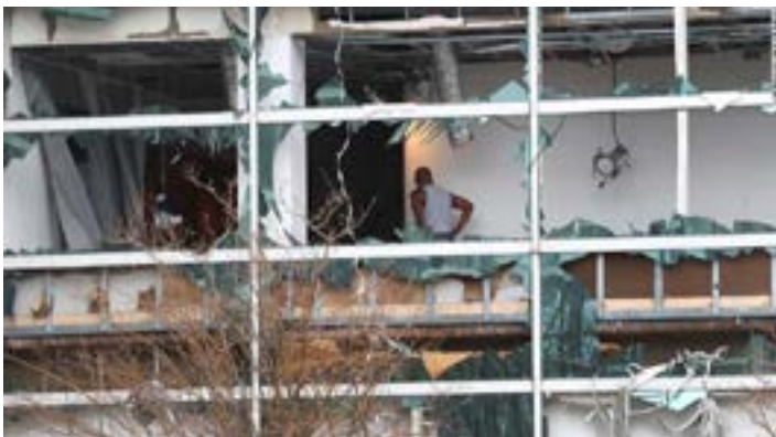
↑ Tarps on rooftops after Laura, but before Delta ↔ Shattered windows in the Capital One Bank tower.