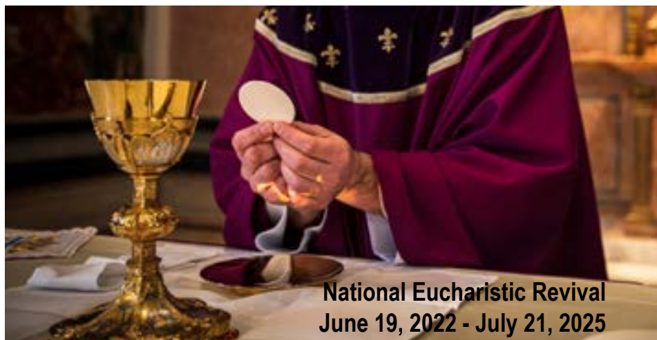
National Eucharistic Revival June 19, 2022 - July 21, 2025

The initiative will be take place over three years: